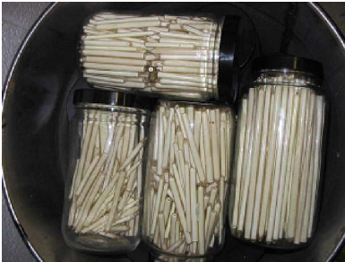
Samples of glass Light Tubes ready for crushing

If the high temperature furnace mode is used to remove tritium from specimens, the furnace is evacuated after the specimens are installed but before heating. Since the specimens may contain some free HTO the exhaust will be passed through a mol sieve bed to capture tritium before release to stack via the getter bed.